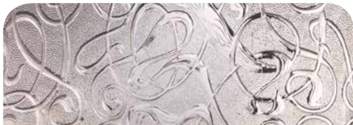
Everglade™ Privacy Level 5

Choose from a wide range of great Pilkington designs