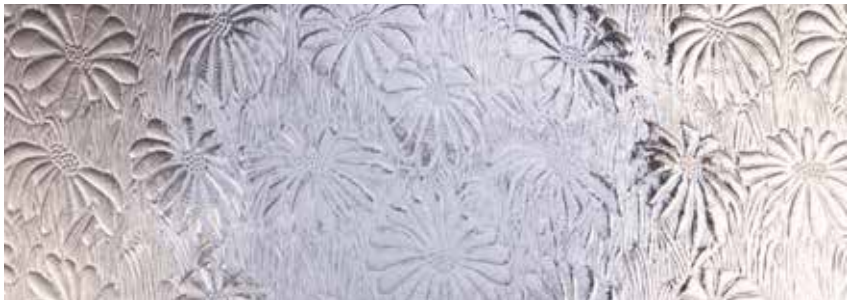
Mayflower™ Privacy Level 4