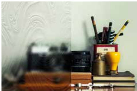
Privacy Level 3