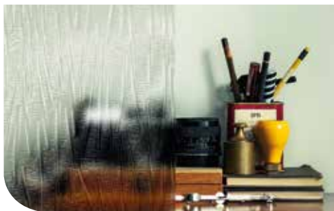
Privacy Level 4