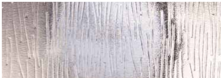
Charcoal Sticks™ Privacy Level 4