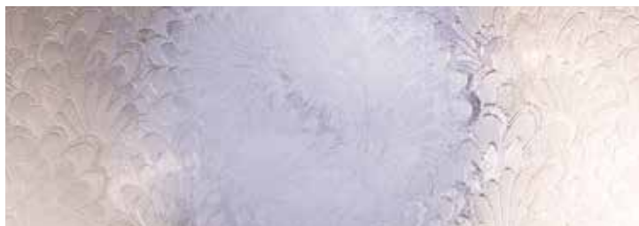
Pelerine™ Privacy Level 5