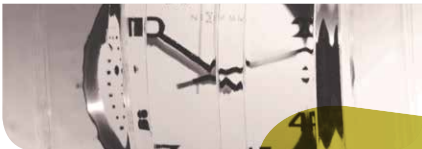
Warwick™ Privacy Level 1

To discover more about the use of Warwick™ please visit our website