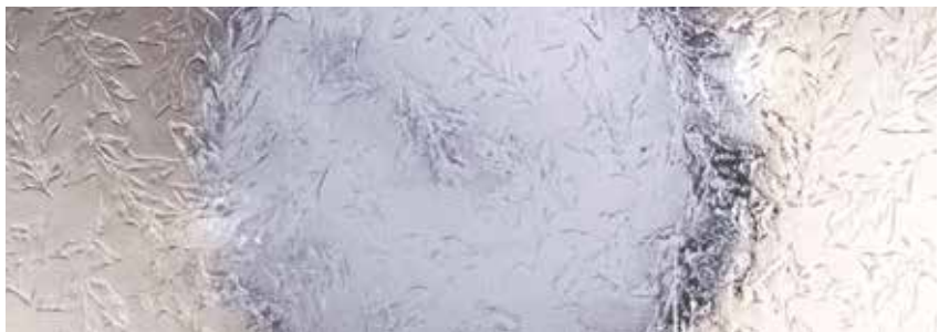
Oak™ Privacy Level 4