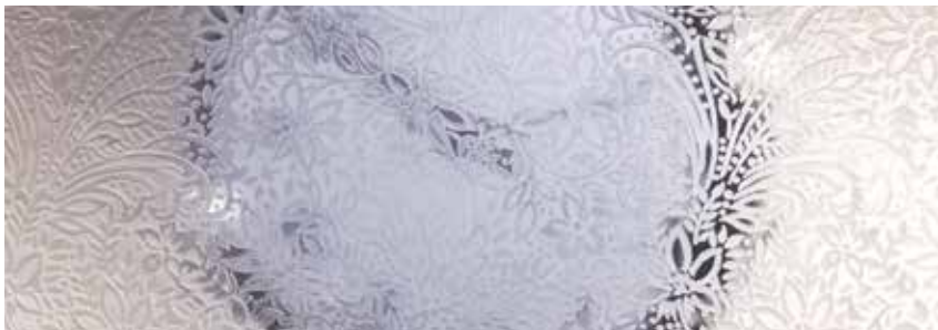
Chantilly™ Privacy Level 2