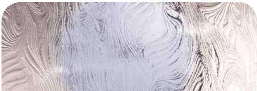
Taffeta™ Privacy Level 3