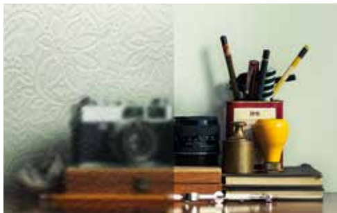
Privacy Level 2