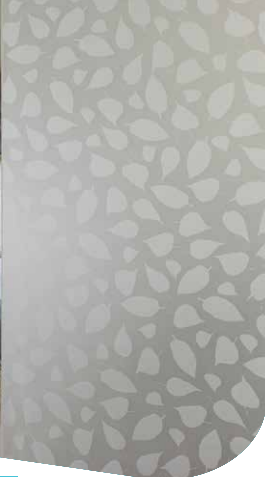
Bay™ Opal Privacy Level 5