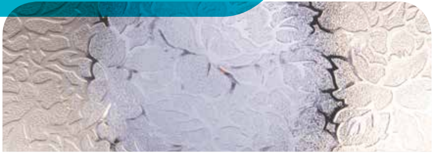
Florielle™ Privacy Level 4