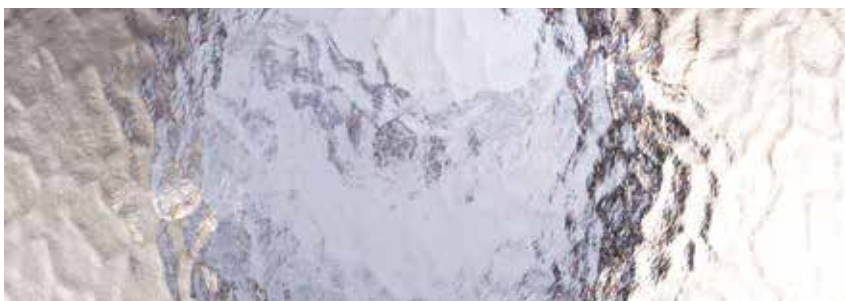
Minster™ Privacy Level 2