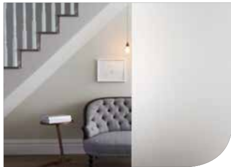
Pilkington Optifloat™ Opal Privacy Level 5