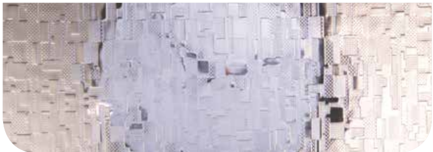
Digital™ Privacy Level 3