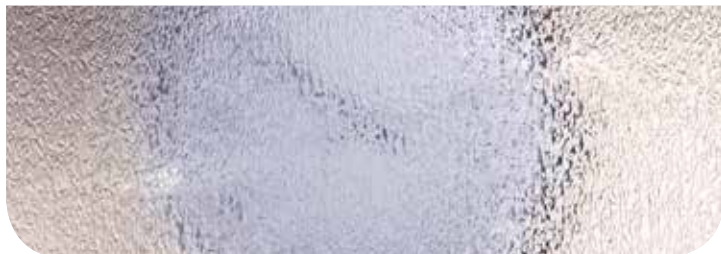
Contora™ Privacy Level 4