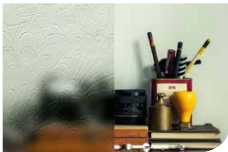
Privacy Level 5